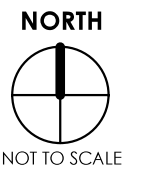
EXHIBIT A : REZONE MAP