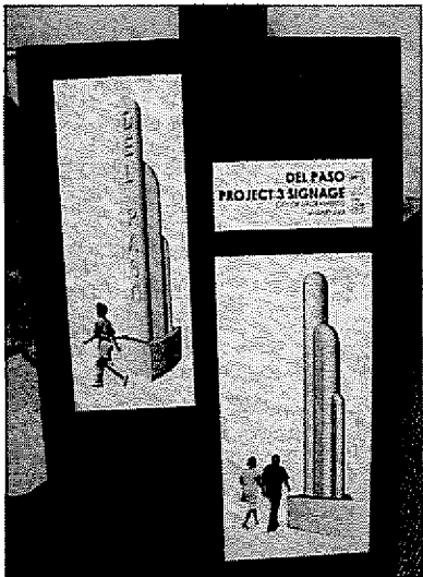
El Camino Gateway

Description: Two gateway projects, one larger element at El Camino ($79,800) requested for approval in June 2006 and a smaller element at Hwy. 160 on Del Paso Blvd. requested for approval in this staff report ($50,000). Created in an Art Deco style, the functional signage/sculptures consist of stainless steel, 18' high and 12' high, with raised letters reading "Del Paso Blvd." The El Camino gateway element will include bronze plaques citing the history of the Del Paso community. Both sculptures will include dramatic up lighting and the artwork will be viewed by vehicular and pedestrian traffic. The elements will serve as landmarks for the Del Paso community.