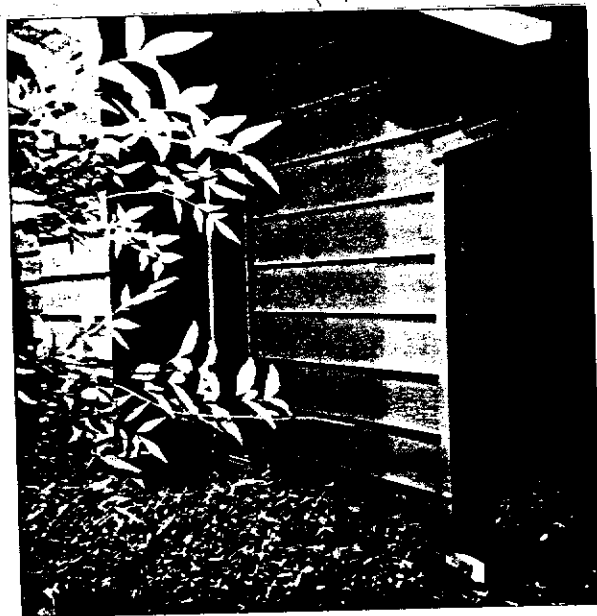
#3 Example 6060 Gloria Dr. Sacramento