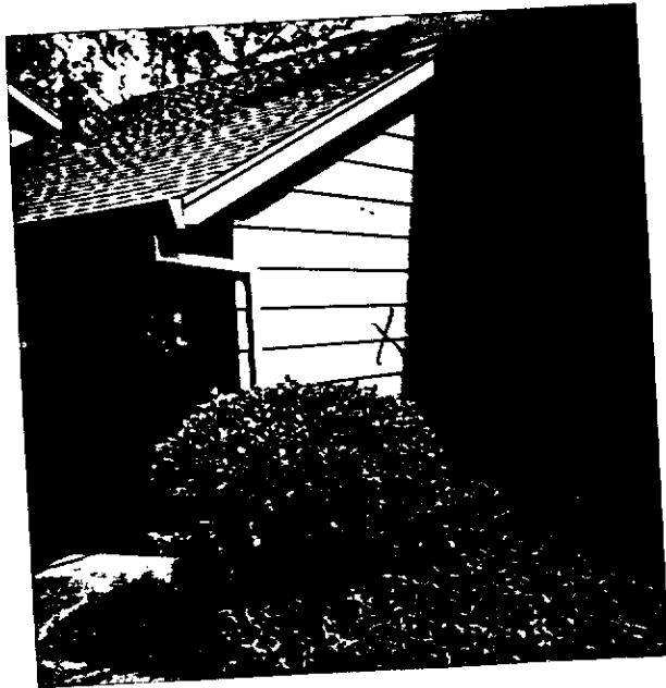
#19 6060 Gloria Dr. subject site, Sacramento subject wall