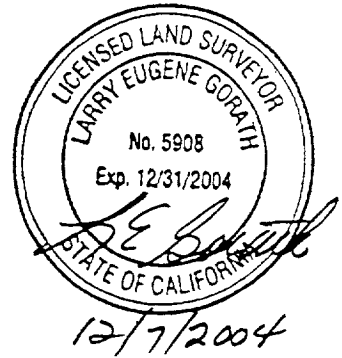
EXHIBIT "A" LEGAL DESCRIPTION EASEMENT RELINQUISHMENT

All that certain real property situate in the City of Sacramento, County of Sacramento, State of California, described as follows: