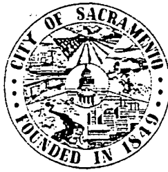
EXHIBIT I 22