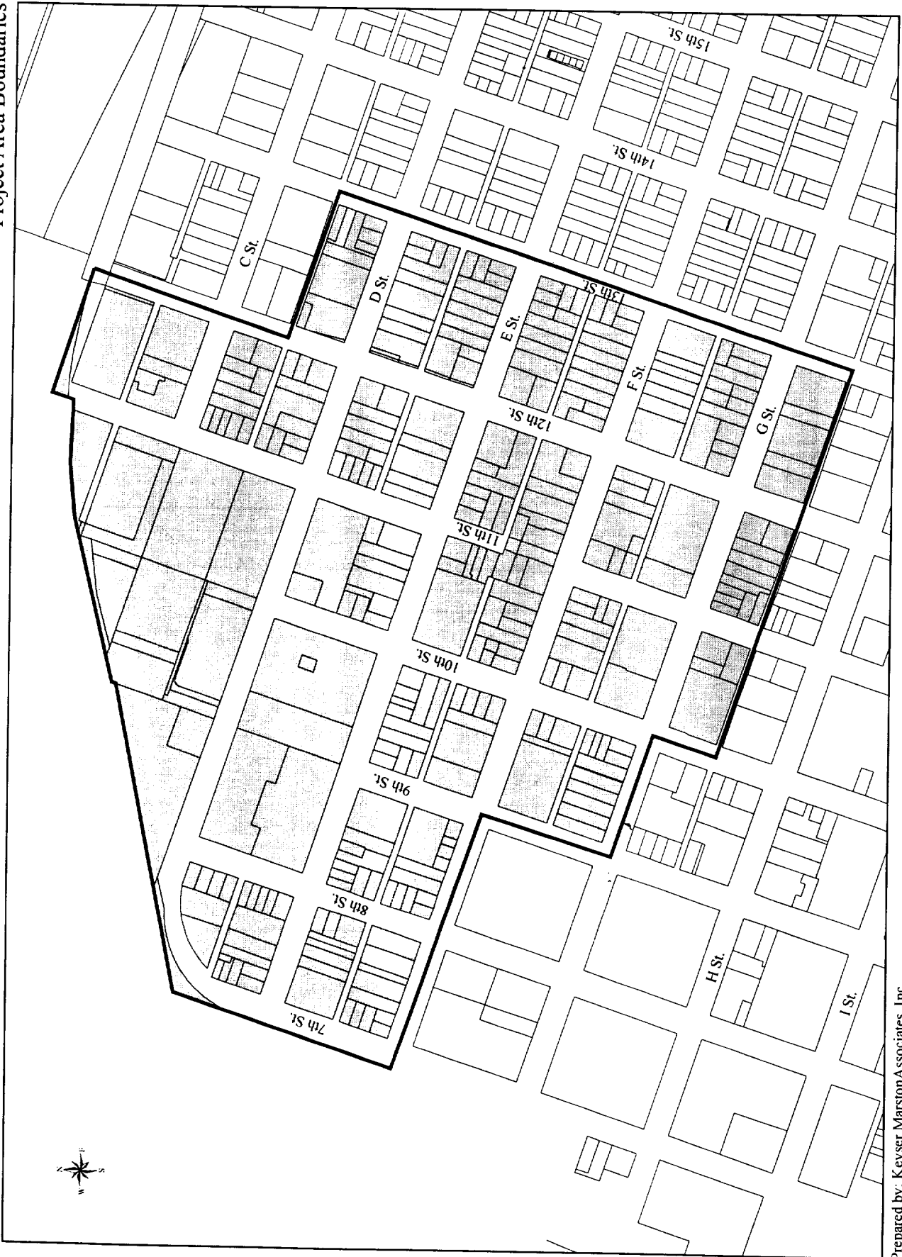
MAP 1 Project Area Boundaries

Sacramento Redevelopment Agency Alkali Flat Redevelopment Project