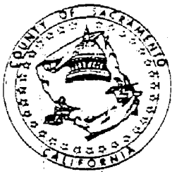
EXHIBIT B 27 SACRAMENTO COUNTY COMMISSION ON AGING

909 - 12th Street, Suite 200 Sacramento, California 95814 (916) 447-7065